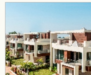
REGENCY WILLOWS LONAVALA