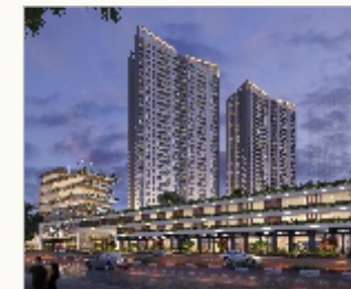
REGENCY LUXURIA DOMBIVLI - EAST