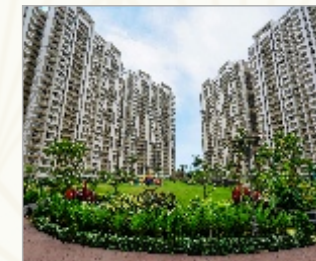
REGENCY ANANTAM DOMBIVLI - EAST