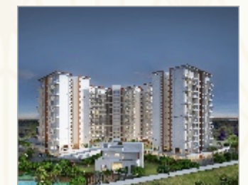
REGENCY ORION BANNER, PUNE