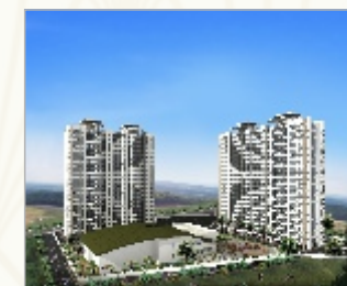
REGENCY HEIGHTS THANE - WEST