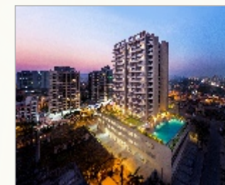
REGENCY ELLANZA KALAMBOLI