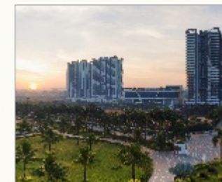
REGENCY ANTILIA KALYAN-MURBAD ROAD