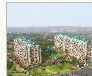
REGENCY MEADOWS DHANORI, PUNE