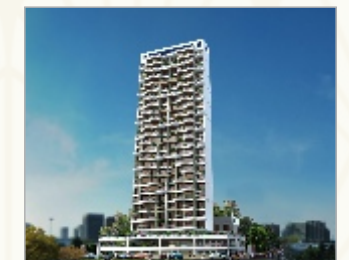
REGENCY ICON KHARGHAR