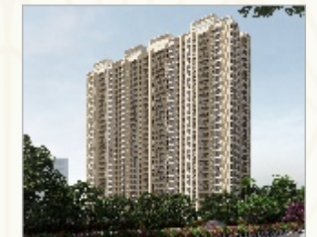
REGENCY AVANA KALYAN-MURBAD ROAD