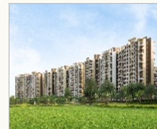
REGENCY SARVAM TITWALA - EAST