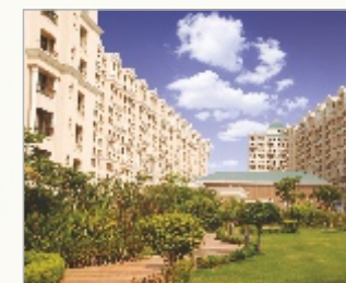
REGENCY ESTATE DOMBIVLI - EAST