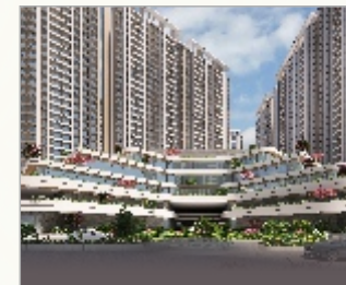
REGENCY ANANTAM NXT DOMBIVLI - EAST