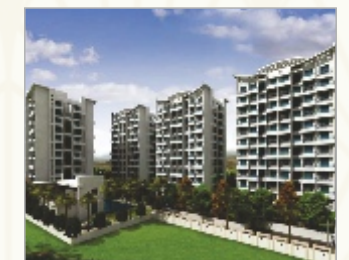
REGENCY COSMOS BANNER, PUNE