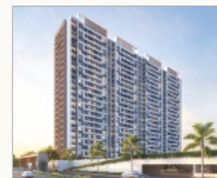
REGENCY ASTRA BANNER, PUNE