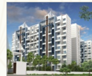
REGENCY CLASSIC BANER, PUNE